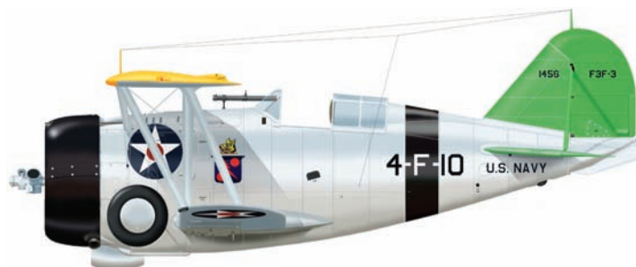
VF-4 Grumman F3F-3. Note the Neutrality Patrol star on the fuselage.