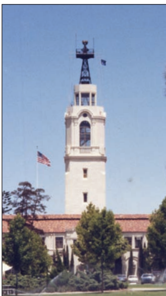
Commander, Naval Air Forces Headquarters building, constructed in 1918-1920 at Naval Air Station North Island.

The Centennial of Naval Aviation kicks off January of 2011 and continues as a year-long celebration with a variety of events and commemorations throughout the year. Airshows, art exhibits, flyovers and tactical demonstrations are but a few of the events being planned.