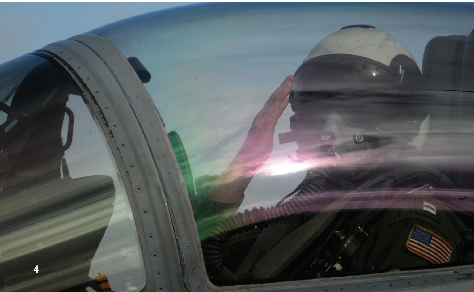
2009 - Navy Lieutenant in F/A-18C Hornet assigned to the "Rough Riders" of Strike Fighter Squadron (VFA) 125 salutes the catapult officer, or "shooter," before launching from the flight deck of the Nimitz-class aircraft carrier USS Ronald Reagan (CVN 76).