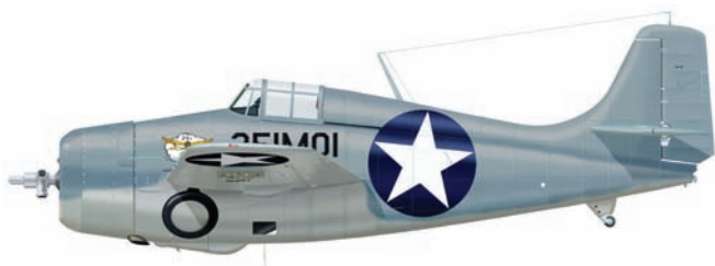
Grumman F4F-3P Wildcat assigned to VMO-251 in the Solomons

While no longer known as VMO-251, the squadron is still operational and is currently flying the F/A-18C Hornet .