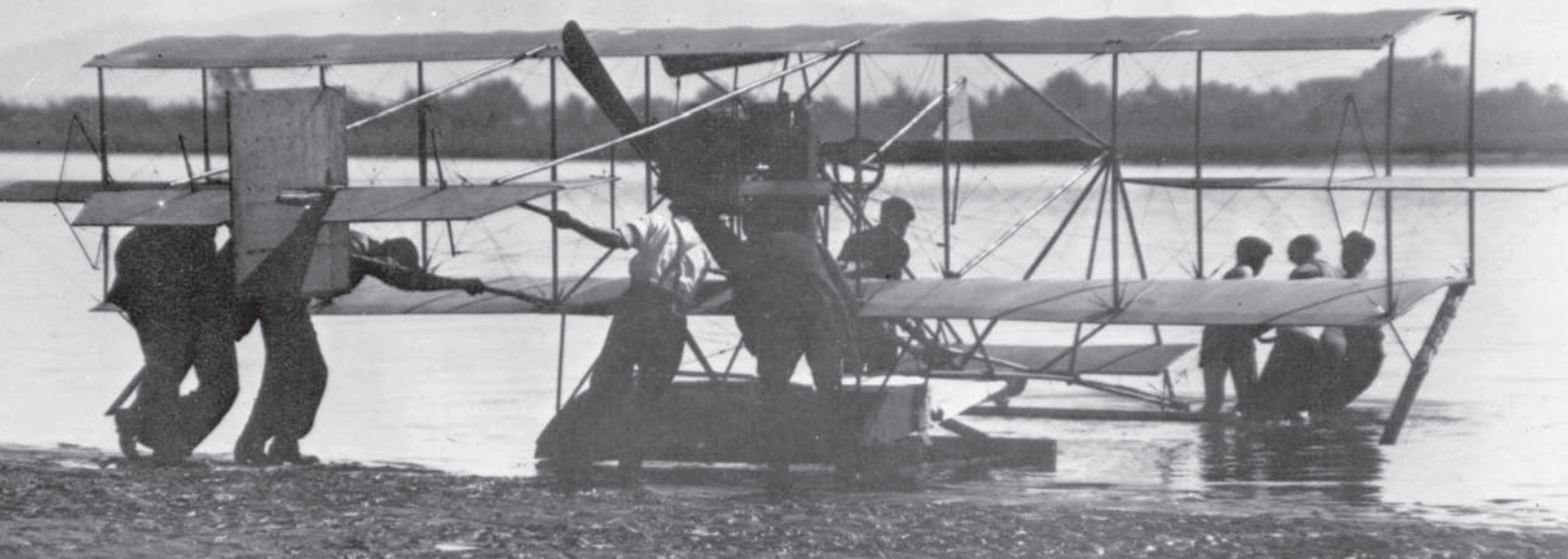
A Curtiss "Hydroaeroplane" is pushed into the water in preparation for flight at North Island in January 1911. On the 26th of the same month this aircraft achieved a notable aviation "first" by being the first aircraft to operate from water. Note that the engine has a pusher propeller and the ailerons are independent of the wings.

On 8 May 1911, Captain Washington Irving Chambers, United States Navy, officer in charge of aviation, prepared the requisition for the Navy's first aircraft to be purchased from aviator and inventor Glenn H. Curtiss. After 98 years, Naval Aviation has grown from a tactical afterthought and support capability to a primary instrument of our national security. From the Curtiss A-1 Triad, to the F/A-18 Super Hornet, from the USS Langley (CV 1) to the USS George H.W. Bush (CVN 77), Naval Aviation has scored an impressive list of achievements in peace and war. The first crossing of the Atlantic by air, victory at the Battle of Midway, and the first American in space, to name a few, have put Naval Aviation at the forefront of our national destiny.