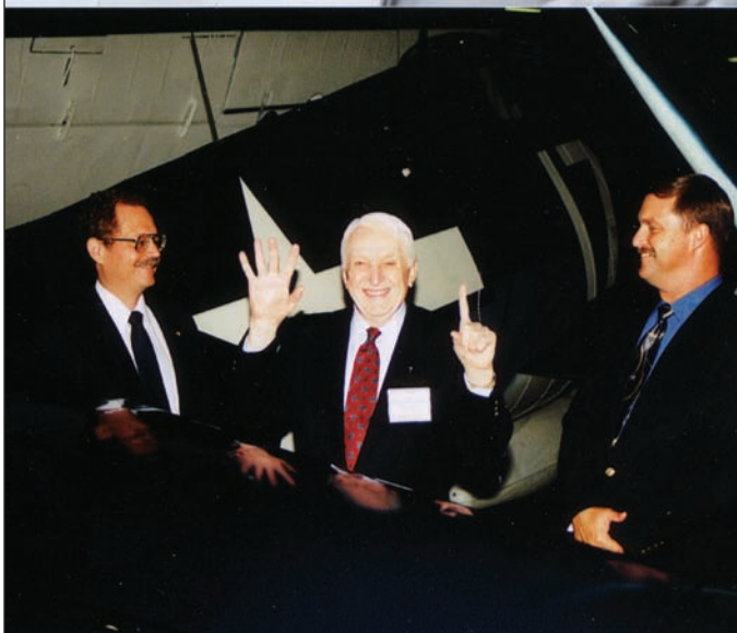
On 19 June 1944, LTJG Alex Vraciu (center) shot down six enemy aircraft to become an "ace in a day". The top photo was snapped shortly after landing. The lower photo was taken at the Naval Aviation Symposium in Pensacola in May 2002.