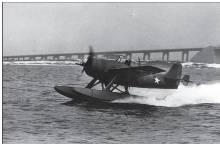
F4F-3S "Wildcatfish" (BuNo 4038) takes off Near NAS Norfolk in February 1943.

Have you ever heard of the F4F-3S "Wildcatfish"? Didn't think so. But yes, it was real and it did fly. Based on the Grumman F4F-3 airframe, the Navy put forward a requirement for just such a fighter aircraft. At a time when the U.S. was on the defensive in the Pacific, the lack of forward bases was a real concern, hence the Wildcatfish . At one point, the Navy had 100 of these aircraft on order, but later modified the contract when the island "crisis" had passed and the Seabees came to the rescue, constructing airstrips in amazingly short time. The 100 aircraft were eventually built as normal F4F-3s, with conventional landing gear. These were also the last Grumman-built Wildcats , as by then, production had shifted to General Motors Eastern Aircraft Division in Linden, New Jersey.