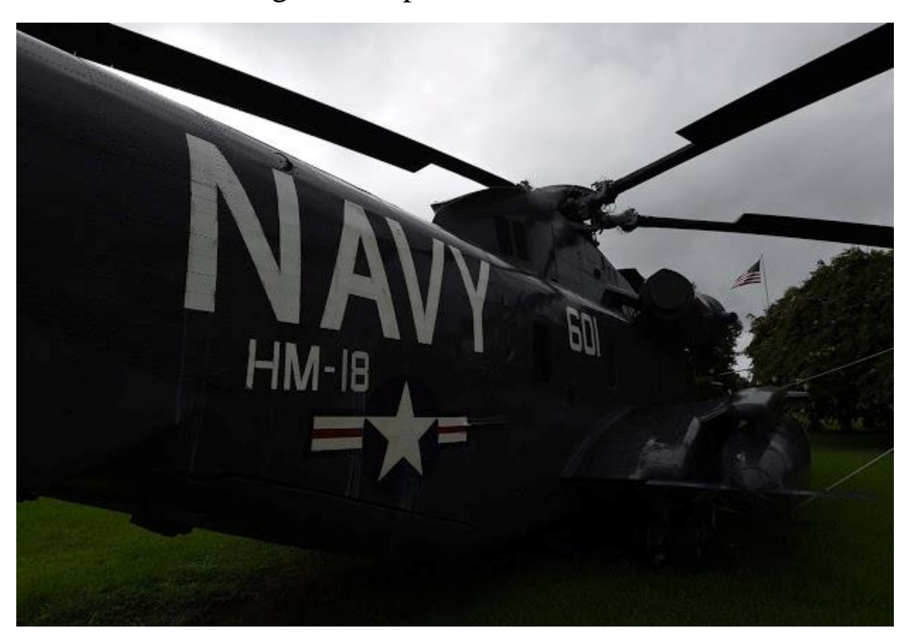
<sup>1</sup>The display RH-53D located at Ely Park on Naval Station Norfolk during a recent summer downpour.

the Operational Commander of HM-18, stated that the men were "heroes who dedicated their lives to their country." He made a final perhaps more important point: that it was his hope that the courage and skill shown by those aviators would strengthen their survivors as they met the challenges of going forward after the tragic loss.xii[12] It is the abiding lesson and meaning to be drawn from this tragic mishap.