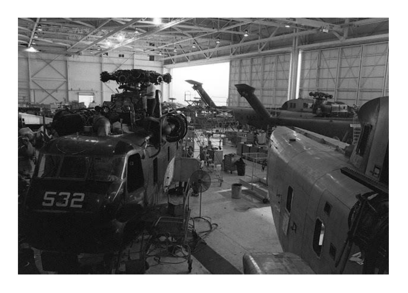
CH-53 Sea Stallion helicopters undergo sheet metal maintenance and repair at the Naval Aviation Depot, NAS Pensacola, Florida, in 1989.