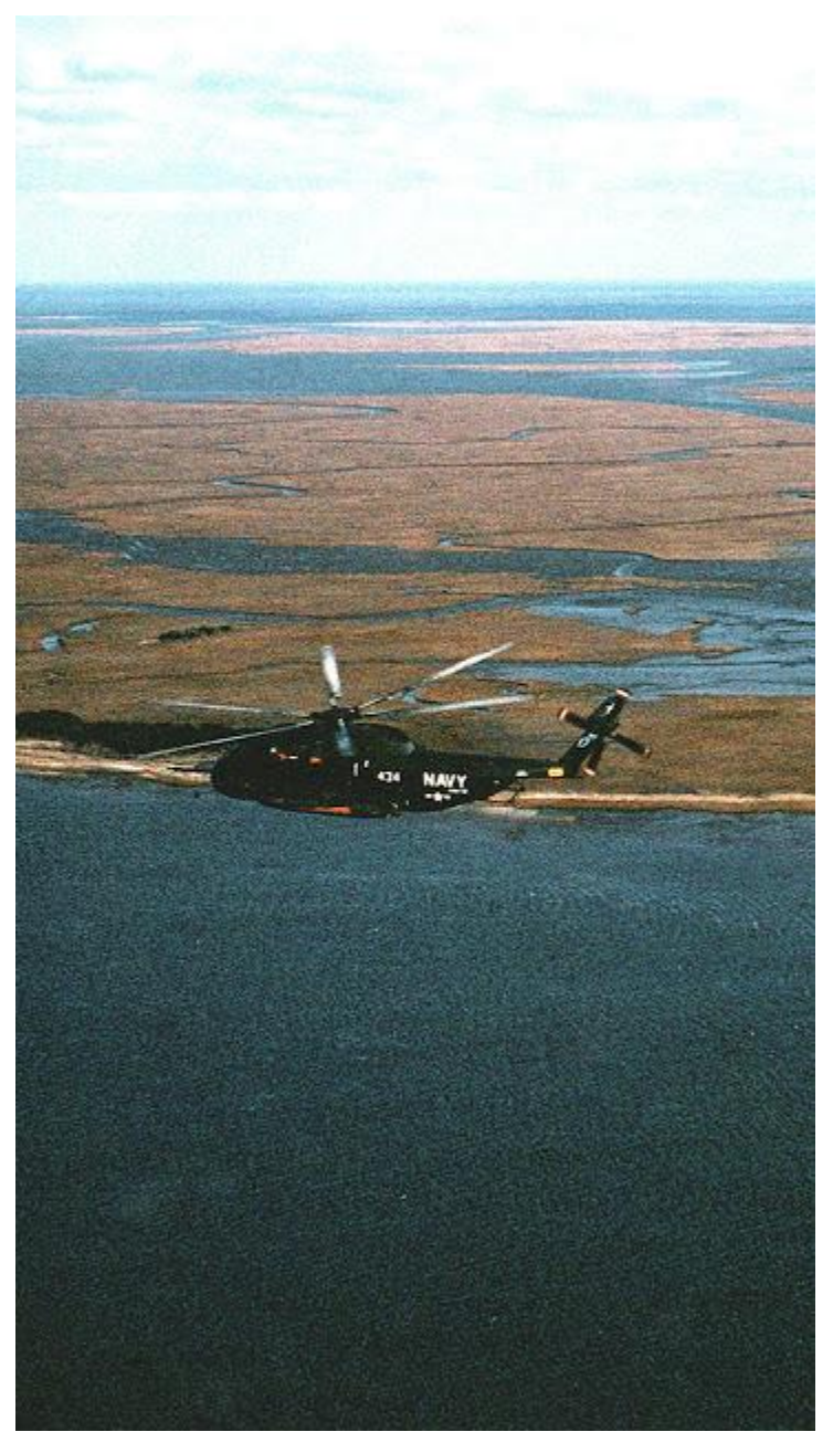
An RH-43D flies over Chesapeake Bay in December 1981.

U.S. Navy aircraft. It also reminds us of an event that, although tragic, was one from which those who remain can find strength to prevail over adversity.